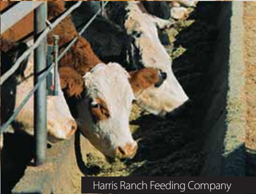
Harris Ranch Feeding Company

At Harris Ranch, we believe that raising cattle and environmental stewardship go hand-in-hand. For us, as well as our ranching partners, the land is not just where we raise our cattle; it's also where we raise our families. We have a personal stake in the quality of the environment and are always looking for ways to improve it. For those that raise cattle, sustainability means ensuring that the land will provide for the next generation by focusing on the well being of not only our livestock but also by maintaining the natural resources of the land.