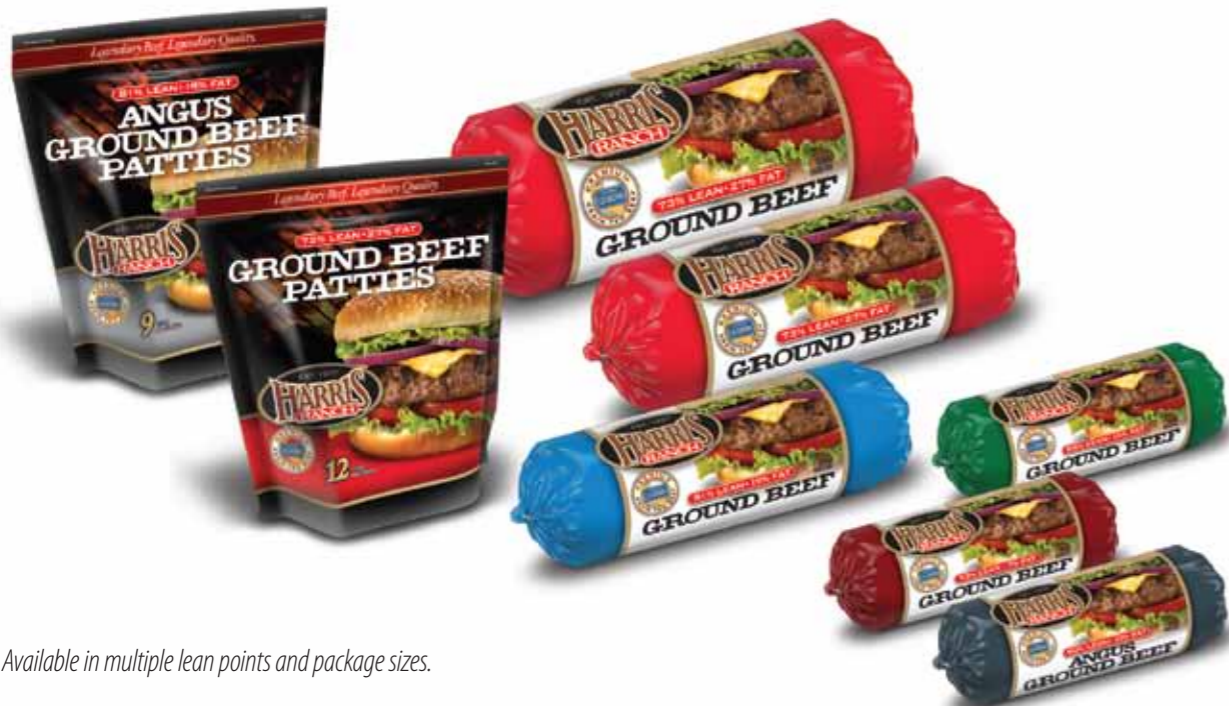
Available in multiple lean points and package sizes.